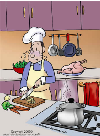
Sometimes cutting an onion can be so emotional!

We are beginning a unit on fractions. Our focus will be on fraction concepts—finding equivalent fractions, comparing fractions, changing mixed numbers to improper fractions. Shopping allows students refine basic math skills. Use the holidays to create math field trips. Allow children to estimate the total price of your purchase at the grocery store. Let them figure the surface area of a gift box. Ask how much flour is needed if you double the cookie recipe. Use everyday activities to create interest in math. In the classroom we are studying fractions. Allowing your child to help cook Thanksgiving and Christmas treats will reinforce using fractions in their world and help you out as well (he who cooks must clean!) Remember to check agendas for information about class work and home work. Happy Holidays!